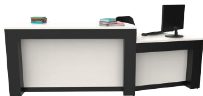
Reversible Options Available: ACCENTV3R

Optional Acute Version Also Available: ACCENTV2L See Below Comparison