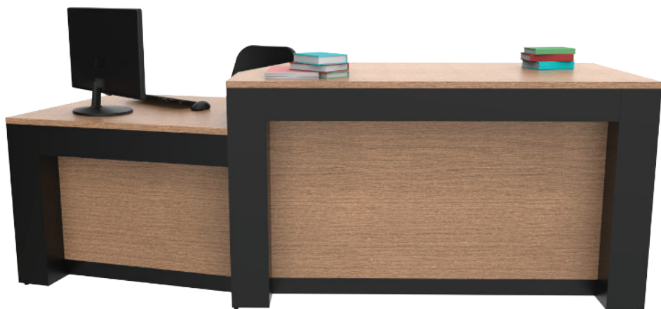
Accent Customer Service Desk in Rock Maple and Charcoal

Dual height to accommodate both a seated and standing workspace, the stylish accent desk is available in a broad range of laminate colour combinations. Two cable outlets are included as standard. Mirrored option available.