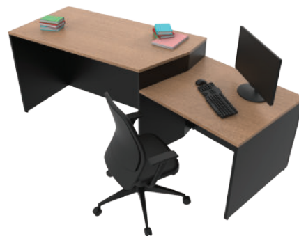
Accent Customer Service Desk Back View in Rock Maple and Charcoal

For book return chutes, refer to our Shelving and Display Systems catalogue.