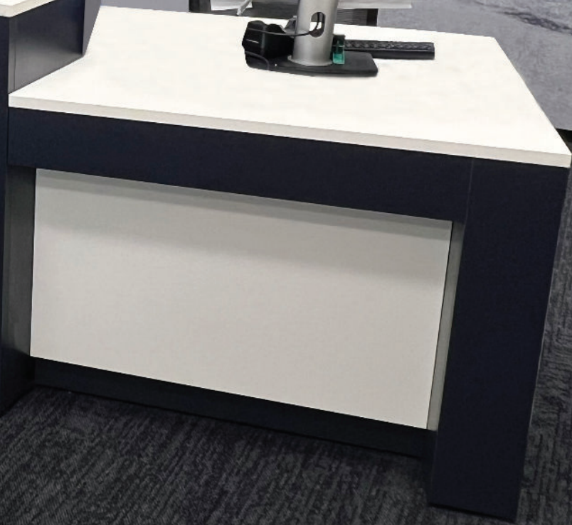
SOMERVILLE LIBRARY - VIC