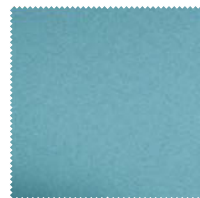
Falling Water FWR