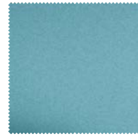
Falling Water FWR