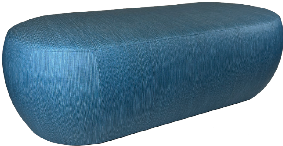
Pebble Bench in Linea Cruiseline

DISTINCTIVE CURVE SHAPE IS MAINTAINED BY A TIMBER FRAME AND HIGH DENSITY FOAM. USE INDEPENDENTLY OR TEAM WITH A STUDY TABLE TO CREATE A STUDY SET.