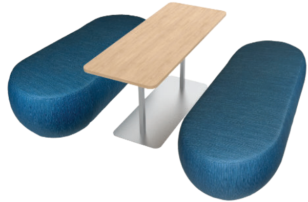
Bench Pebble Ottomans Can Be Paired with Study Table or Flip Table to Create Study Set