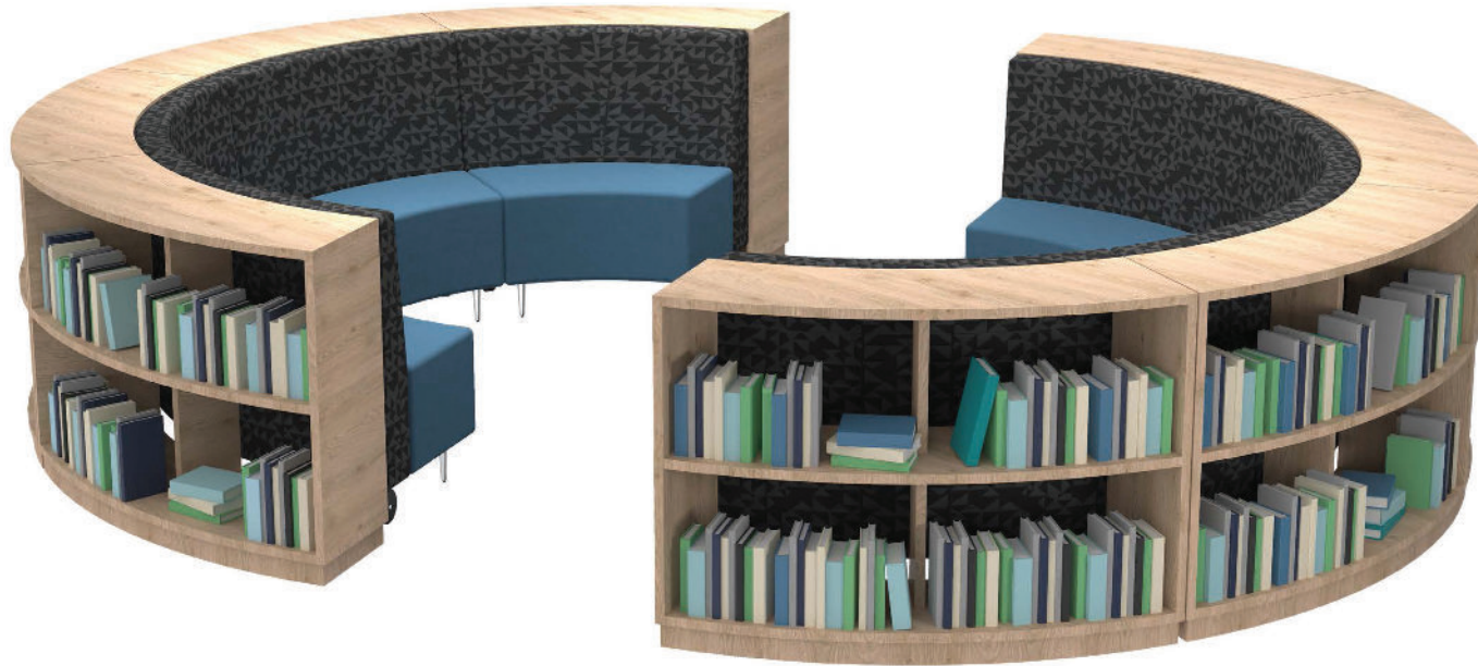
2 x Cove Bookcase Sets in Rock Maple Booth Seat Back in Echo Flint Booth Seat Base in Studio Encore Windsor

COVE SET INCLUDES 4 MODULES (SMALL) OR 6 MODULES (LARGE), FORMING A HALF CIRCLE WHICH CAN BE USED INDEPENDENTLY OR IN PAIRS. FABRICS AND LAMINATES CAN BE CUSTOMISED. FIXED SHELVING HEIGHT ACCOMMODATES FICTION AND NONFICTION.