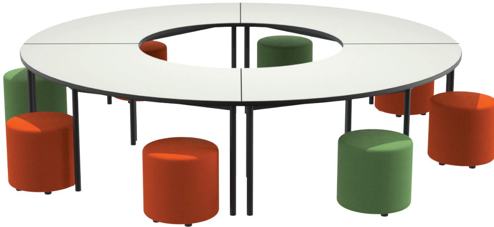
4 x Large Curved Tables In White with Black Edging & Frame, 8 Round Ottomans In Studio Encore Grasshopper and Tangerine