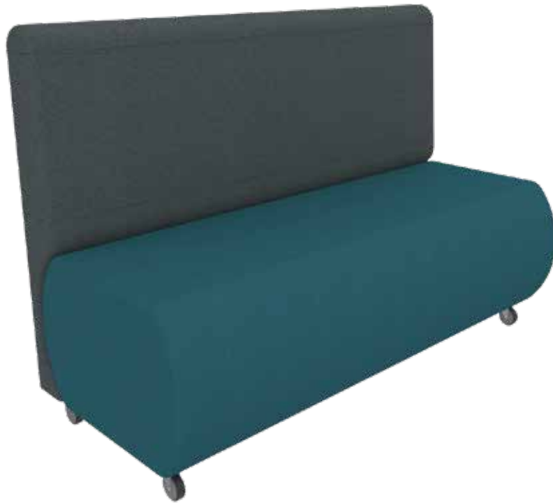
Curva 2 Seater in Space Platinum and Space Capri

CONTRASTING FABRICS HIGHLIGHT THE DESIGN OF THE CURVA LOUNGE. MANUFACTURED WITH HIGH DENSITY FOAM AND TIMBER FRAME.