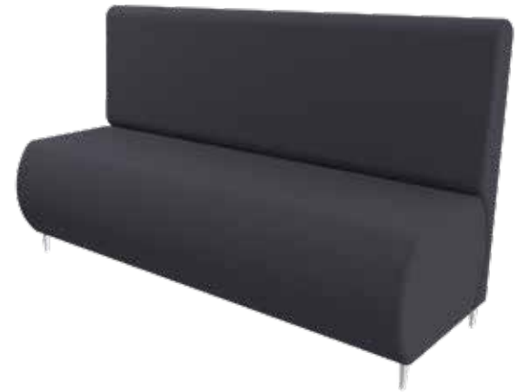
Curva 3 Seater in Space Carbon