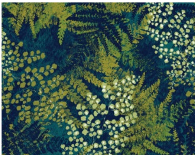
Fern Citron CTR

HEAVY COMMERCIAL: 50,000 RUB COUNT 90% Polyester 10% Polyurethane