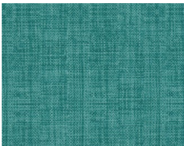
Tweed Spearmint SPM