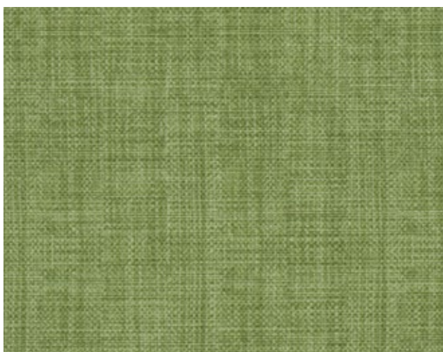
Tweed Sweet Pea SWP