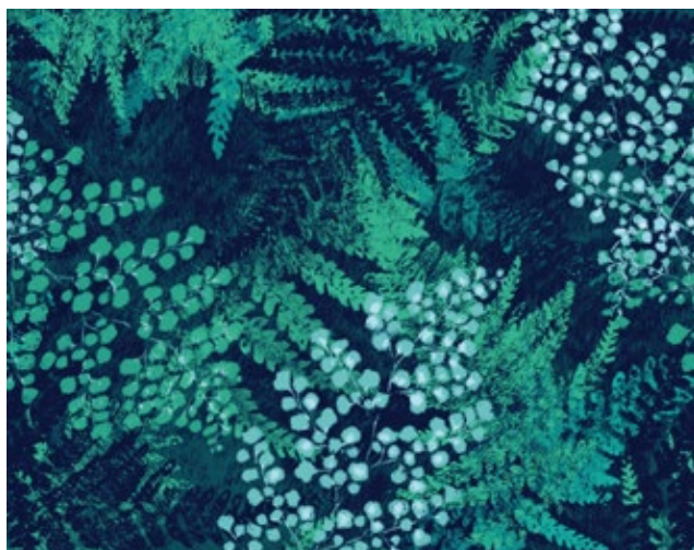
Fern Lagoon LGN