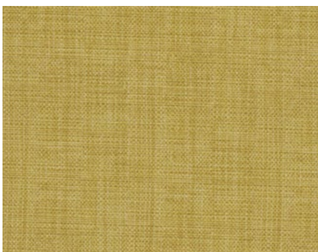
Tweed Mustard MSD