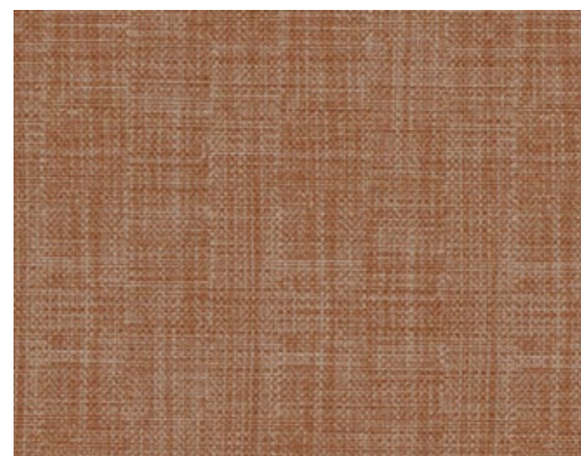
Tweed Uluru ULR