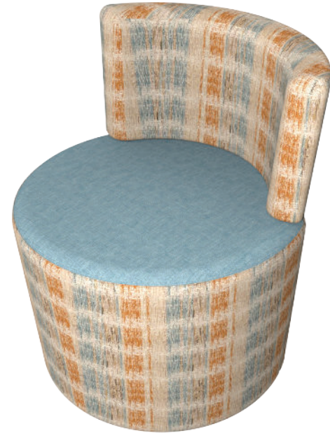
Ottoman Chair Base & Backrest in Komodo Pak Canyon Seat Top in Komodo Naturama River

Ottoman Chair OTTCHR 750 H X 608 W (Seat 450 H)