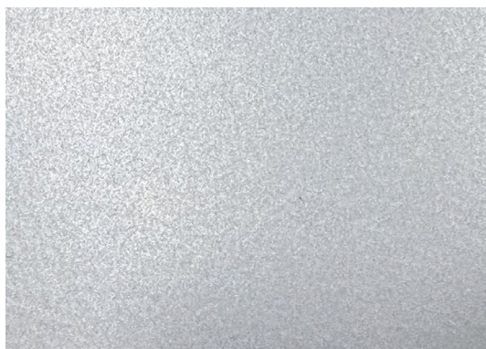
Interpon Silver (Satin) IS