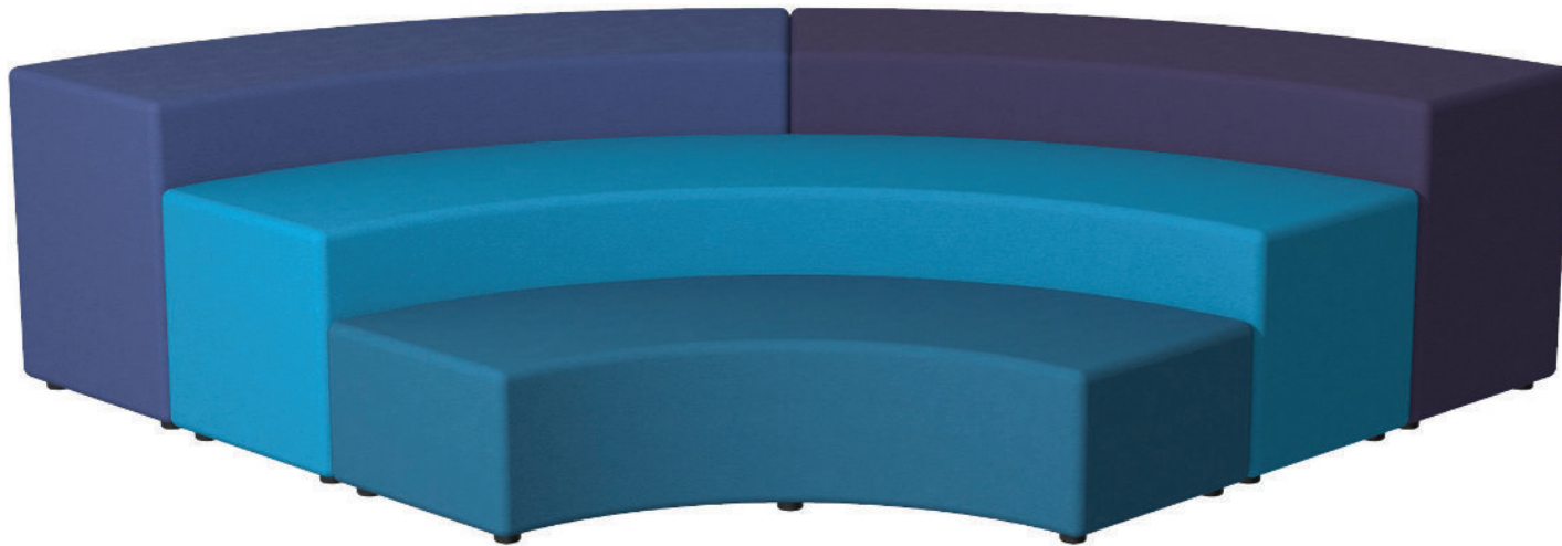
Stadium Seating in Studio Encore Vinyl: Atlantic, Lagoon, Caribbean, Plum

FOUR OTTOMANS OF STAGGERED HEIGHTS COMBINE TO CREATE STADIUM SEATING. INCLUDES TIMBER FRAME AND HIGH DENSITY FOAM. DESIGNED FOR STORY TIME OR SMALL GATHERINGS. FITS APPROXIMATELY 15 PRIMARY AGED CHILDREN PER SET.