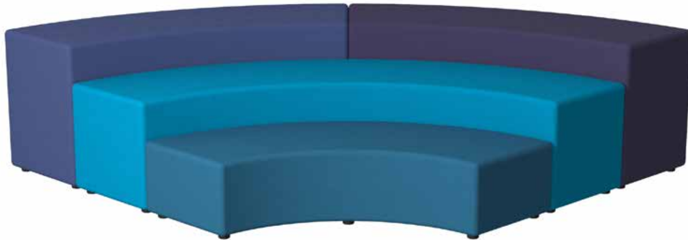
Stadium Seating in Studio Encore Vinyl: Atlantic, Lagoon, Caribbean, Plum