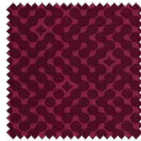
Tempura STK30 TEM