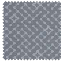
Udon STK31 UDO