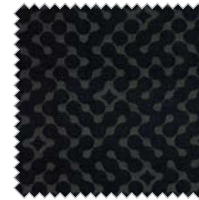
Sake STK28 SAK