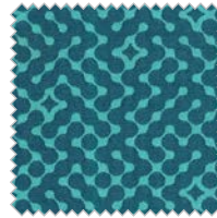
Dashi STK20 DAS