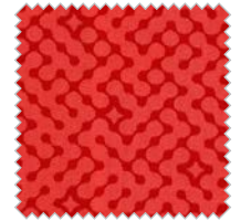
Mirin STK23 MIR