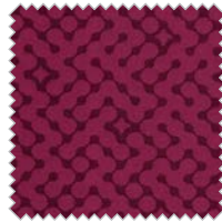
Panko STK25 PAN