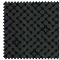
Ponzu STK26 PON