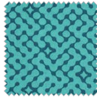
Miso STK24 MIS