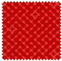
Rayu STK27 RAY